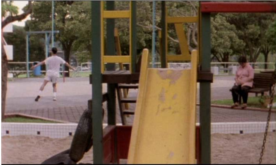
Figure 3.2 Meng deliberately shifts his body to avert from San-San