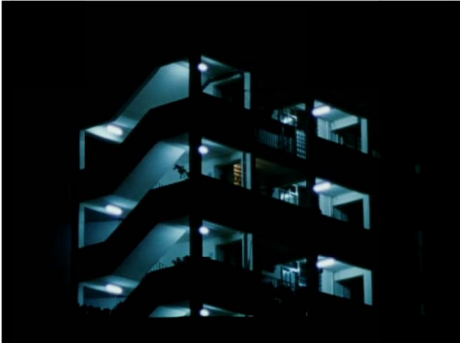
Figure 1.3 Khoo focuses on the HDB's geometrical uniformity