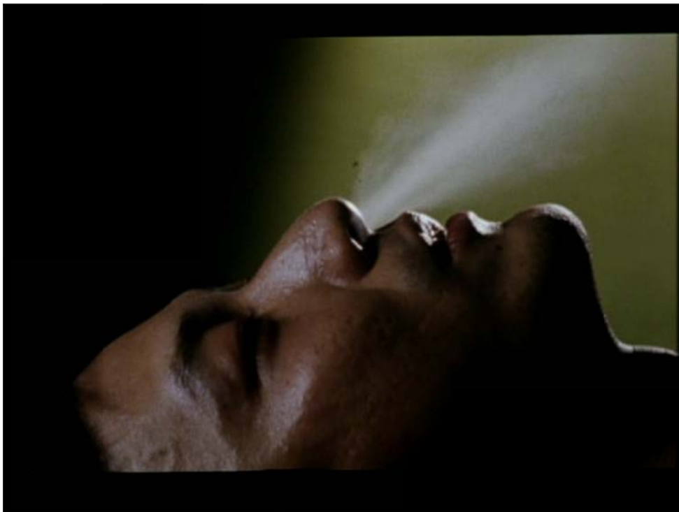
Figure 2. Close up of a man exhaling cigarette smoke

unstable interiority is hinted at, demonstrating how the body can betray interiority. Similarly, the shot of Li-Li crying alone in her room (Figure 3.1 and 3.2) demonstrates the body's expression of sadness — tears manifest the tumult of emotions that she must face leaving her lover in China to come to marry a “rich” Singaporean man only to be tricked by him. Her retort to Ah-Gu's claim that he is a rich man living in a mansion also functions as Khoo's critique of the HDB.