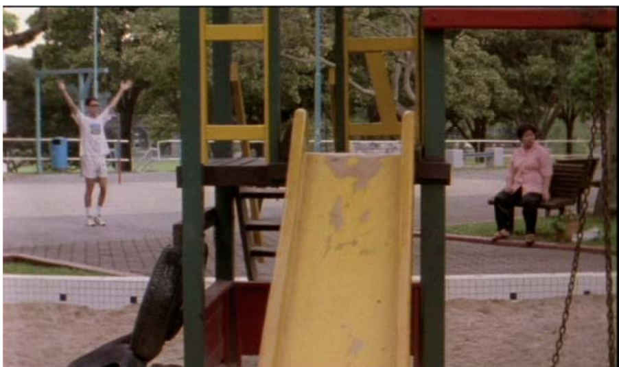
Figure 3.1 Neighbours Meng and San-San at the playground

2.2). Khoo, without the use of dialogue, is able to show Meng's thoughts through a single gesture. The body is thus a structure embedded with interior meaning in the same way that the domestic and private is contained within the structure of the HDB. In the frame, the space of the playground in the extreme foreground, demonstrating its presence that alerts the viewer to the embedded messages of fun and community connoted by the playground. Ironically, this does not materialize as they both Meng and San-San continue in silence, somewhat ashamed to be sharing a private moment in this public space. In spite of the HDB's clustered communities and communal spaces, these spaces no longer serve the aim intended by its government-commissioned architects. This illuminates Ballantyne's notion that architecture exceeds the architect — borrowing from Roland Barthes's concept of the death of the author — as the building becomes a text that is interpreted by its user, and so the architect's intentions are neglected in favour of the experiencing individual, who ultimately possesses the agency to define and determine the role and function of the building for his/herself 19 . Architecture is thus a “sense” that “lies in the mind of the beholder”. 20