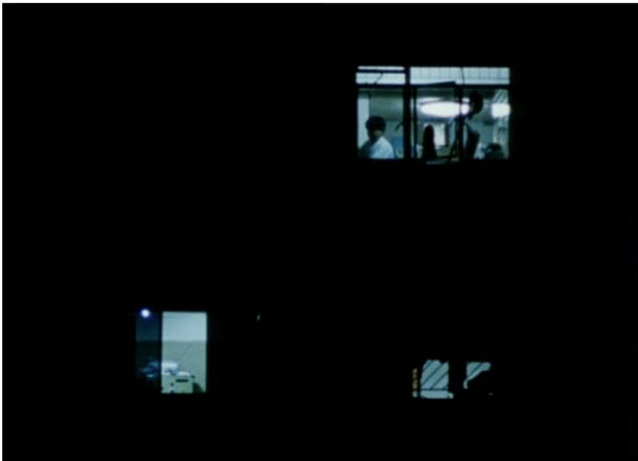
Figure 1.2 Medium shot of San-San in the top-most lighted window