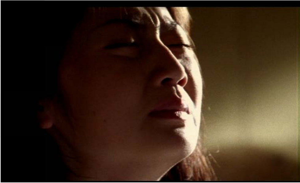
Figure 3.1 Close-up of Li-Li crying alone in a dark room